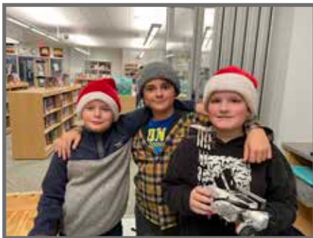
Winners of "Zombie Bash" in Robotics Club!

In the fall, the Robotics Club teams competed to program their robots to run a course and use a claw to retrieve the lego built "zombies". This team completed the course in the fastest time! CONGRATULATIONS!