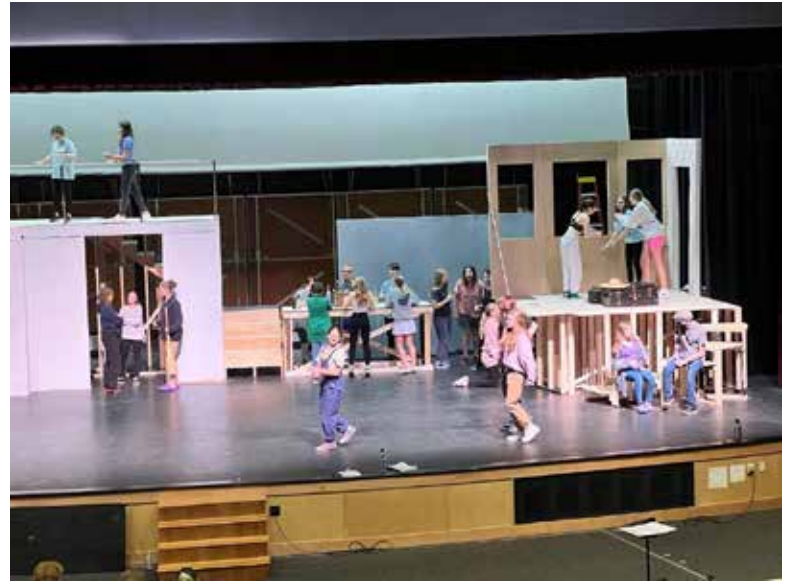
The Mamma Mia! Set under construction

Camden Hills Regional High School is excited to offer the musical production of Mamma Mia! to audiences this November! After a resoundingly successful return to live performances last year, CHRHS will once again turn on the bright lights of Strom Auditorium and bring to life the story of Sophie, a young bride-to-be, who after secretly reading her mother's diary, sets out to find her true father before her walk down the aisle. Twists, turns, and romances develop in a plot that is sure to bring audiences lots of laughter and joy. Paired with the hilarious story of Mamma Mia! are 22 smash hits from the 70's band ABBA! Songs such as "Dancing Queen", "Super Trouper", and "The Winner Takes It All," are guaranteed to get you humming in your seats!