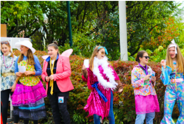
Mamma Mia! Cast members performing in downtown Camden

Performance dates are November 4, 5, 11, 12 at 7pm and November 6 and 13 at 2pm. All seats are reserved for all performances.