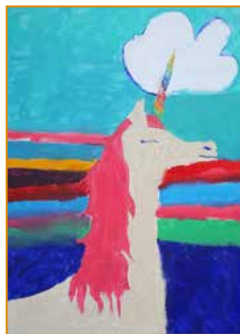
[image credit: "Glitter-corn" by Dakota Surbey, Hazel Page, and Audrey Page, acrylic and glitter on canvas