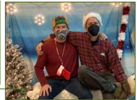
CRMS STAFF GETTING INTO THE HOLIDAY SEASON!