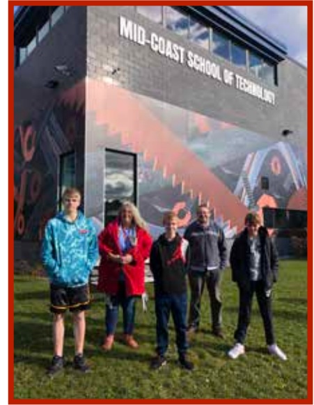
A visit to Midcoast School of Technology